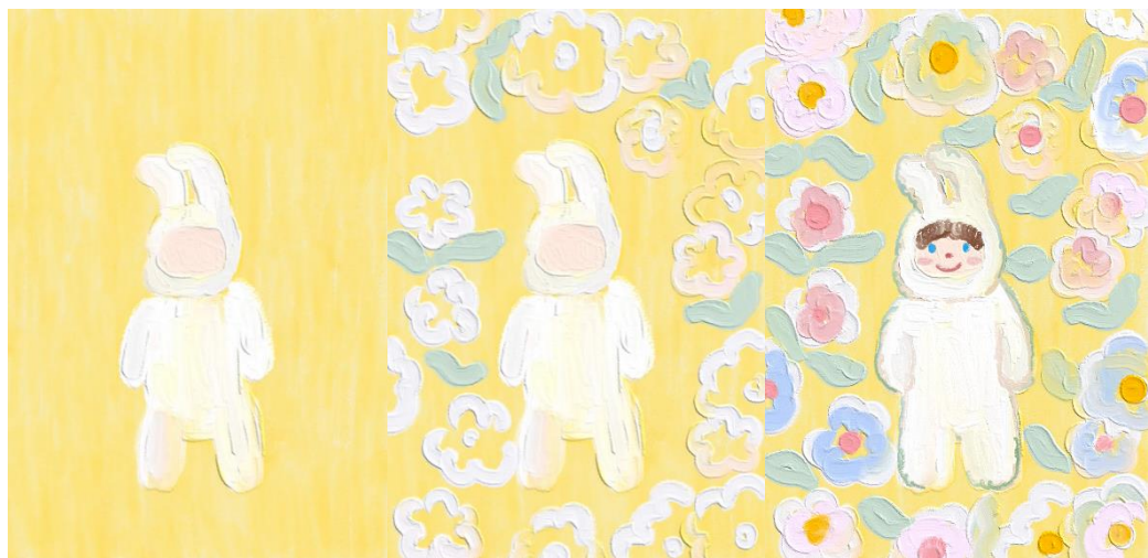
Figure 2 The initial work process to create a work entitled "Among the Flower", 100x120cm, acrylic on canvas, 2021

Then in the next stage is to consider materials and media that can be used to explore new forms. One that the artist uses is acrylic paste medium. This material adds texture to the painting and produces an embossed effect that gives depth to the painting. The next step is to sketch the figure on the canvas. Then exploration is carried out in mixing colours according to the desired concept. The final step is to provide details that can occur spontaneously with bare hands or using the brush in the creation of the work.