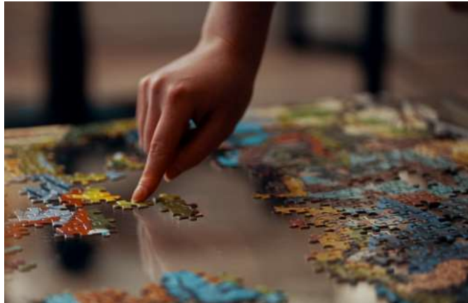
Figure 4. Puzzle