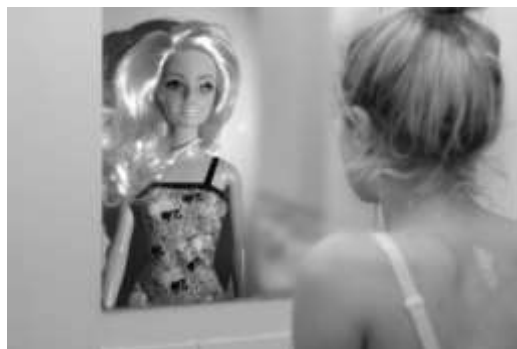
Figure 3. Mirror illustration

Figure 3 above, is an illusory reflection of the figure observing the reflection from the mirror, a doll named Barbie is often said to be beautiful and has a perfect shape, so the figure of a woman who looks at her through the mirror and wants to turn into herself is more than This makes you forget your identity. Emotionally, it seems that in the mirror, it can illustrate what the person in the mirror imagines. This will be explored in the creative process.