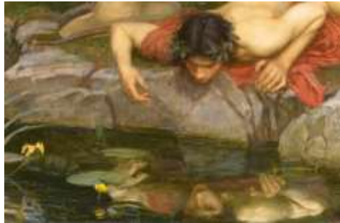
Figure 2. Echo and Narcissus, John William Waterhouse, 1903