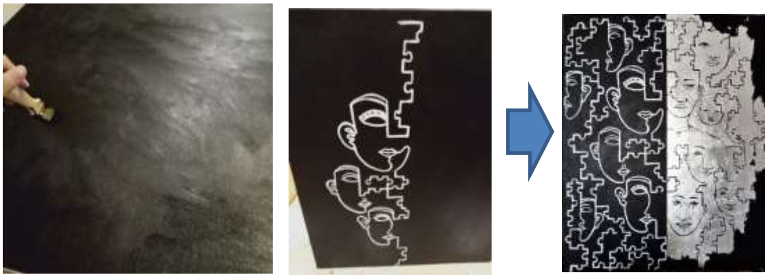
Figure 6 The creative process to create a work entitled Soul and Body, 100 x 80 cm, metal and acrylic paint on canvas. 2021

The next work is making imagination sketches which are expressions of the soul and human expression which are used as a source of inspiration to pour them into this work. The second stage, coloring the background using black acrylic paint to block the background. Figures of imaginary souls are colored with white acrylic paint directly without using pencils or sketches. The next step is to paste the metal foil which is used as a reflection object on the paper on the right. This artwork visualizes the human body using black acrylic paint.