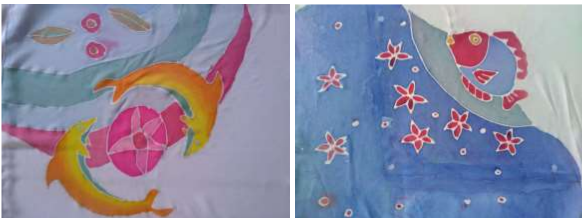
Figure 3. Samples of the 2 nd work exploring objects and coloring

At the beginning, the workshop participants were introduced to batik, of course they thought they would get a difficult batik lesson and time-consuming, but this was on the contrary soon after they started practicing. Even though they were very nervous at first, but encouragement and curiosity emerge so that the first work could be completed, although not maximally. This can be seen from the composition made very simple, there is only a fish and ripples from the sea water under the jumping dolphin. The color used is very simple, namely only yellow on the back and brown on the stomach, while the color of water is only two, namely gray and blue. The line that is made looks very doubtful, it can be seen from the broken lines of the gutta tamarin, so that the thick line connection is visible due to the repetition.