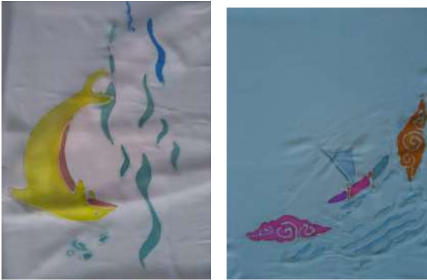
Figure 2. Samples of the first batik tamarin.

At the beginning, the workshop participants were introduced to batik, of course they thought they would get a difficult batik lesson and time-consuming, but this was on the contrary soon after they started practicing. Even though they were very nervous at first, but encouragement and curiosity emerge so that the first work could be completed, although not maximally. This can be seen from the composition made very simple, there is only a fish and ripples from the sea water under the jumping dolphin. The color used is very simple, namely only yellow on the back and brown on the stomach, while the color of water is only two, namely gray and blue. The line that is made looks very doubtful, it can be seen from the broken lines of the gutta tamarin, so that the thick line connection is visible due to the repetition.