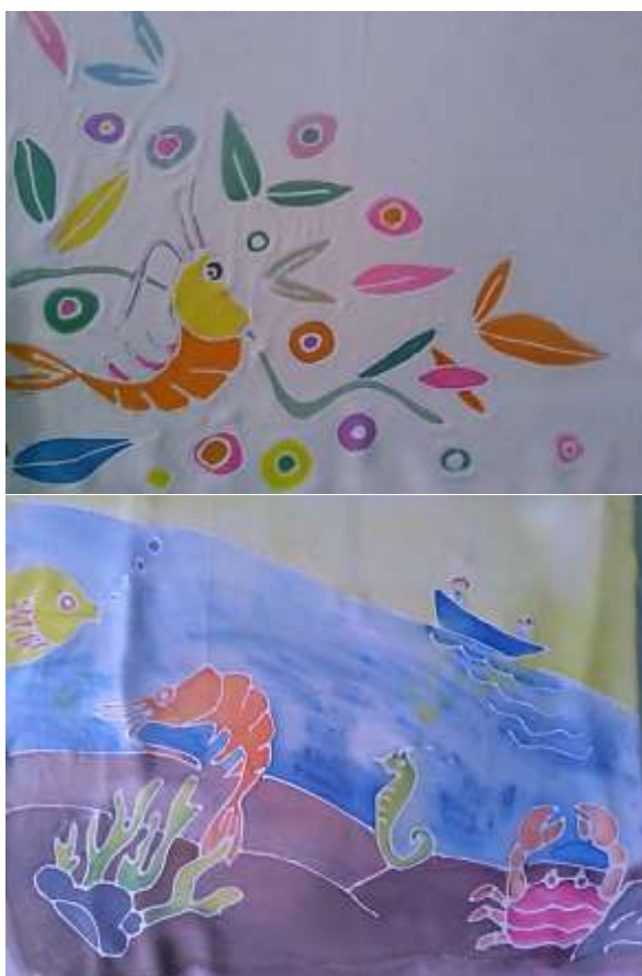
Figure 4. Samples of the 3 rd product combining images, enriched coloring and neat lines

the background 2 crescents behind dolphins. The curved shape is repeated under the pink crescent, with a different color, grayish green, under this gray curve there are 2 flowers and two leaves. The overall composition is very balanced, almost symmetrical, with two dolphins as a point of interest. The color of the dolphin is made using watercolor techniques, using a yellow to orange analogue color, the back is orange, the belly and head are yellow, on the belly there is a gray line that has a different thickness, the smaller the tail the line is and disappeared. The contrast colors of the lines and the fish as well as the thickness of the lines create a sense of motion. The line is also found on the other fish, so that both fishes seems to be chasing. The pink color which forms a monochromatic gradient on the crescent and star as the palest color and the dot color in the middle is the darkest color, making the composition one unit, with repeated curves.