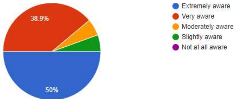
Figure 2: Shows that there are 50% who are extremely aware about the plagiarism issues and 38.9% who are very aware about the plagiarism issues by both teachers and students in higher educational institutions and basic educational institutions, the rest they are moderately aware, slightly aware and not at all are aware. With the figure 2 there is a need to adapt a method to avoid plagiarism issues.

Level of awareness of the students and teachers about plagiarism issues: